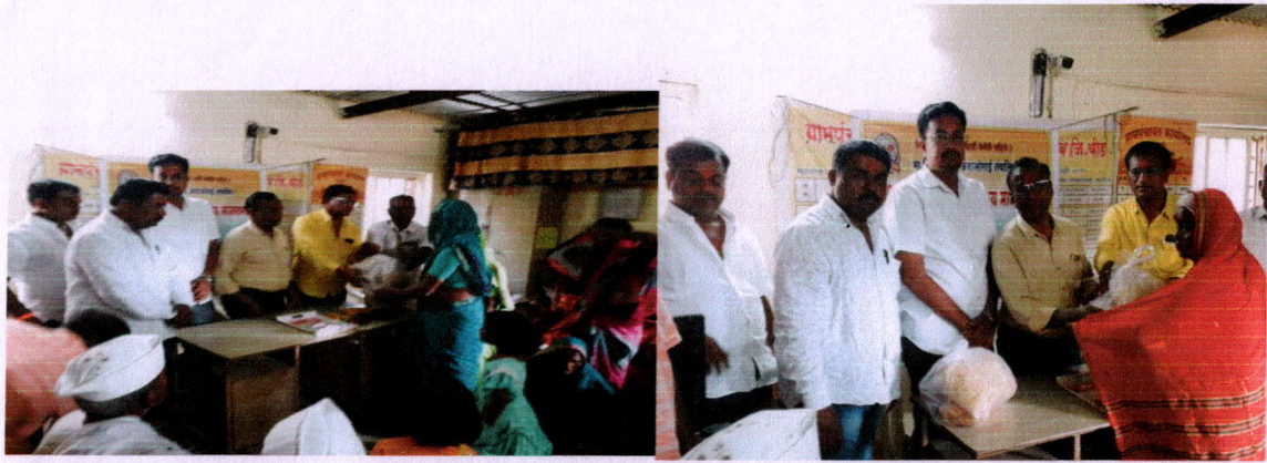
Distributing Shidha to the needy in vivekgram village Manjra