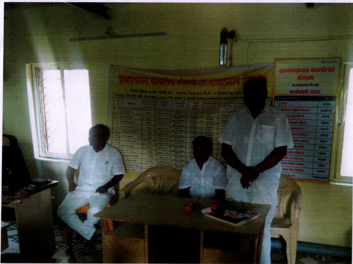
Chief Guest on the occasion of "Gandhi Jayanti Swachhata Saptah" Programme organized at Vivekgram Manjra Ta. Majalgaon by vekgramsamittee on the topic "Vyasanmukti Kalachi Garaj" on date 03 October 2022.